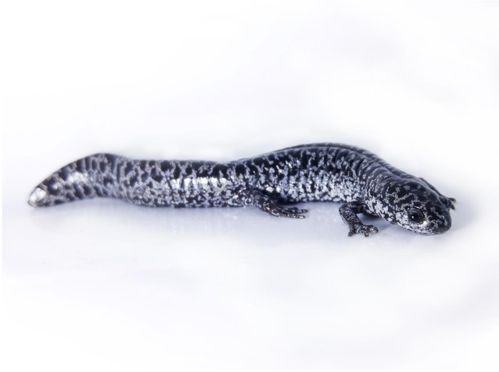
Flatwoods Salamander ( Ambystoma cingulatum).