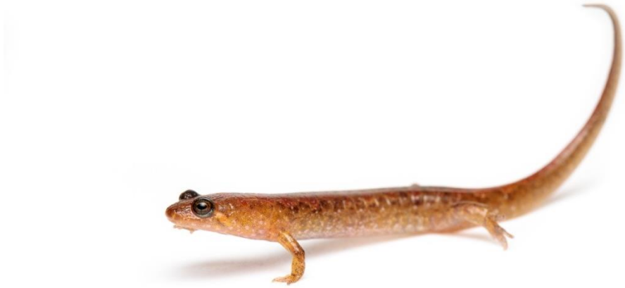
Apalachicola Dusky Salamander ( Desmognathus apalachicola ).