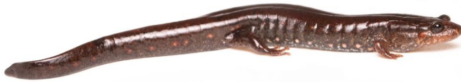
Southern Dusky Salamander ( Desmognathus auriculatus ).