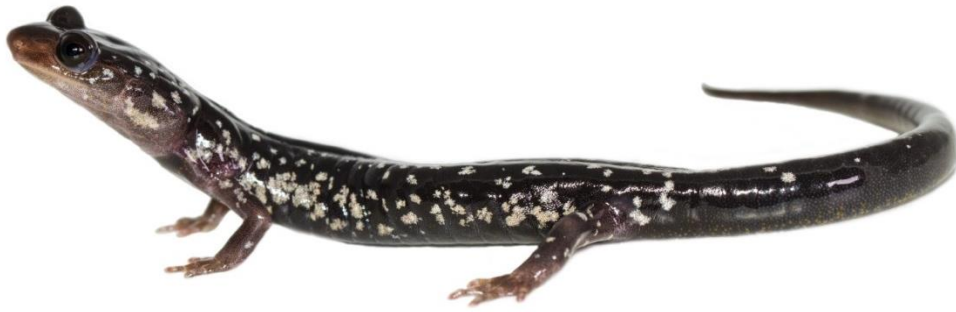
White-spotted Slimy Salamander ( Plethodon cylindraceus ).