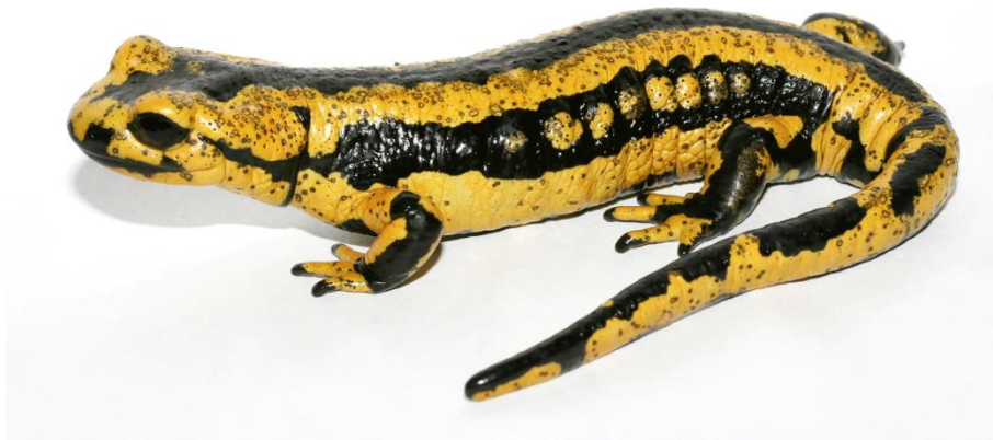
Fire Salamander ( Salamandra salamandra ) infected with Bsal , as evidenced by the dark, circular lesions across its body.