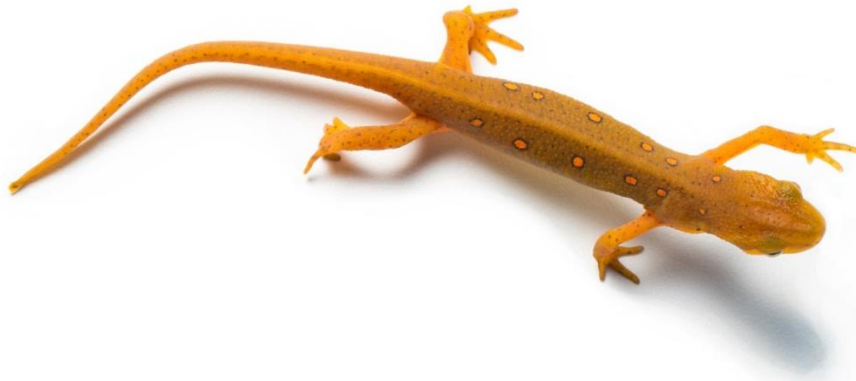
Eastern Newt ( Notophthalmus viridescens ). © Alberto López.