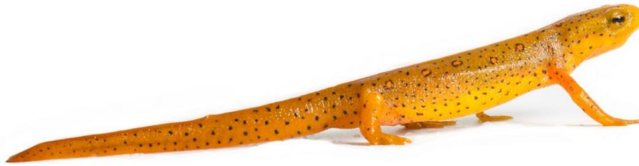
Eastern Newt ( Notophthalmus viridescens ). © Alberto López.