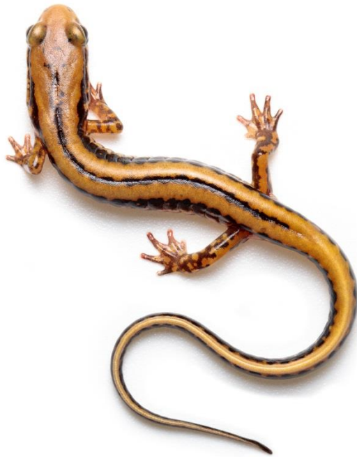
Three-lined Salamander ( Eurycea guttolineata).