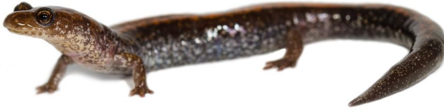
Eastern Red-backed Salamander ( Plethodon cinereus ).