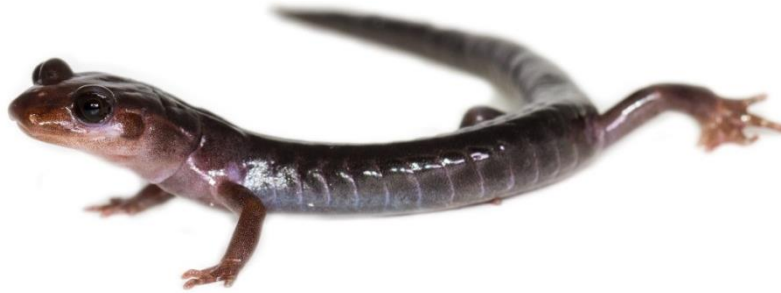
Northern Gray-cheeked Salamander ( Plethodon montanus ).