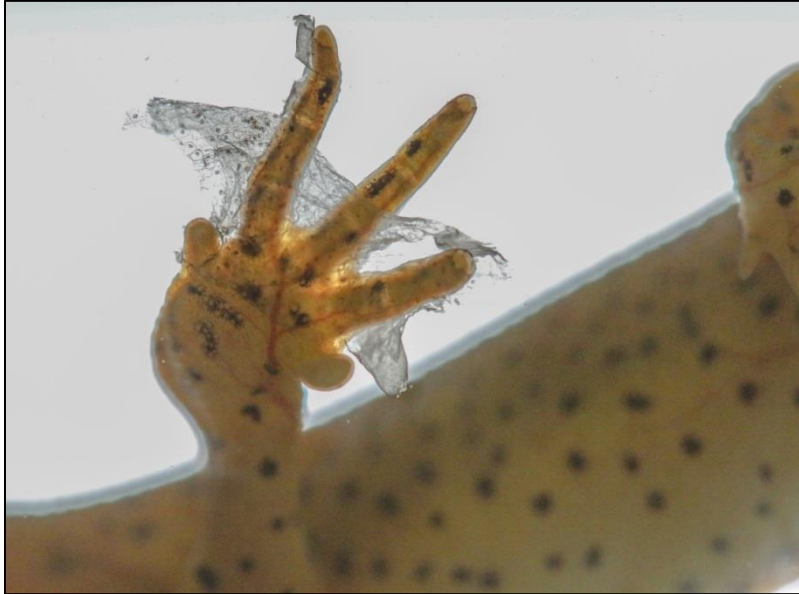
Figure 1. Skin shedding on the foot of a Bsal -infected Eastern Newt ( Notophthalmus viridescens ). Small, circular lesions, a characteristic sign of Bsal chytridiomycosis, can be seen on the base of the foot.