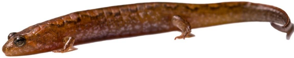
Spotted Dusky Salamander ( Desmognathus conanti ). © Alberto López.