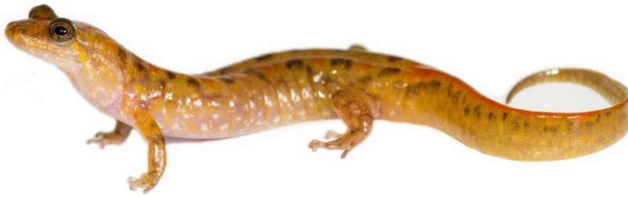
Dusky Salamander ( Desmognathus fuscus ). © Alberto López.