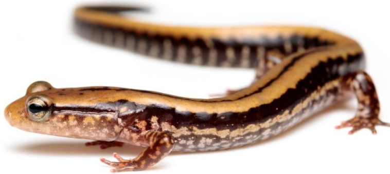
Three-lined Salamander ( Eurycea guttolineata).