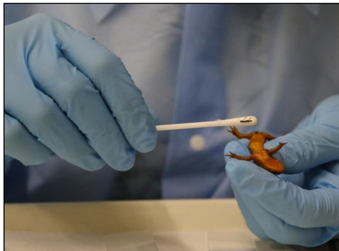
Figure 3. Swabbing the skin of an Eastern Newt ( Notophthalmus viridescens ) to test for the presence of Bsal .

Achieving a broad and robust surveillance network is difficult and expensive because of the labor involved. No single organizational entity has been identified that has this capacity. Instead, the emphasis has been on coordinating and encouraging sampling for Bsal by diverse partners such that something close to a reasonable level of surveillance is achieved. Initial efforts toward this goal are described below. However, because of the limitations of initial approaches, current efforts of the Surveillance & Monitoring Working Group are aimed at building an integrated network of partners in surveillance. This network will increase Bsal awareness, engage volunteer personnel and citizen scientists, utilize dispersed in-kind resources, and increase the amount of Bsal sampling.