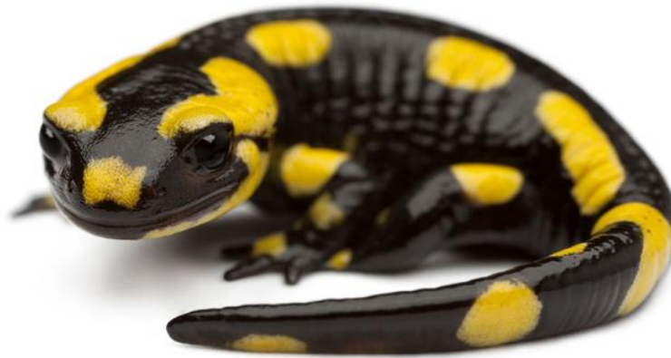
Fire Salamander ( Salamandra salamandra).