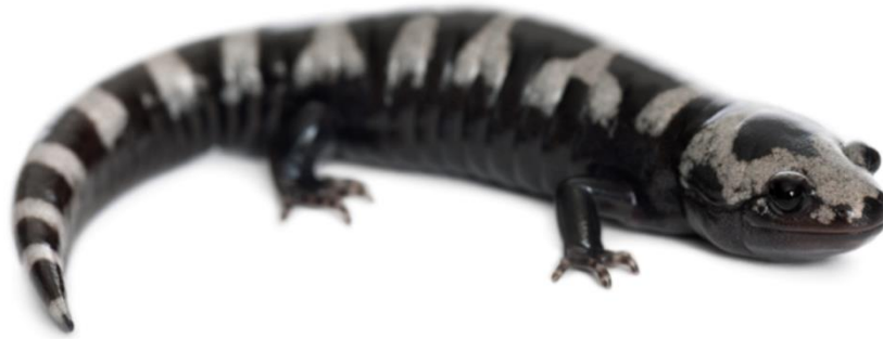
Marbled Salamander ( Ambystoma opacum).