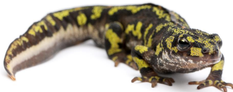
Marbled Newt ( Triturus marmoratus).

James Madison University & Amphibian Survival Alliance Former Lead of the Bsal Task Force