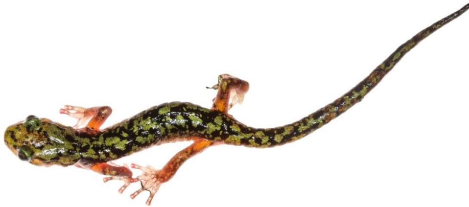
Green Salamander ( Aneides aeneus ) infected with Bsal .