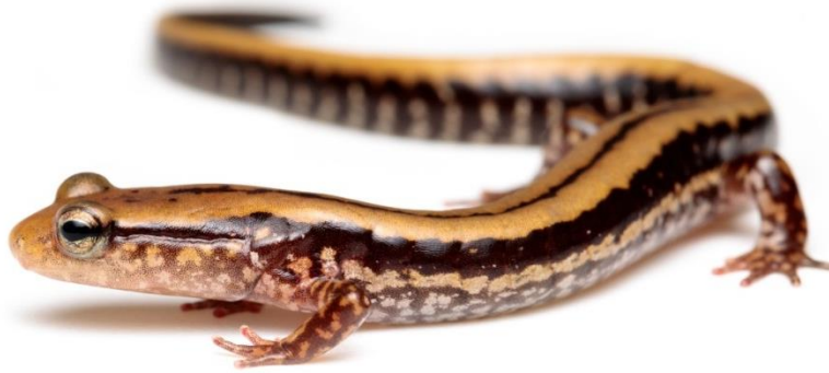
Three-lined Salamander ( Eurycea guttolineata).