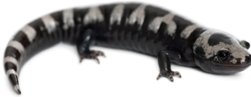
Marbled Salamander ( Ambystoma opacum).