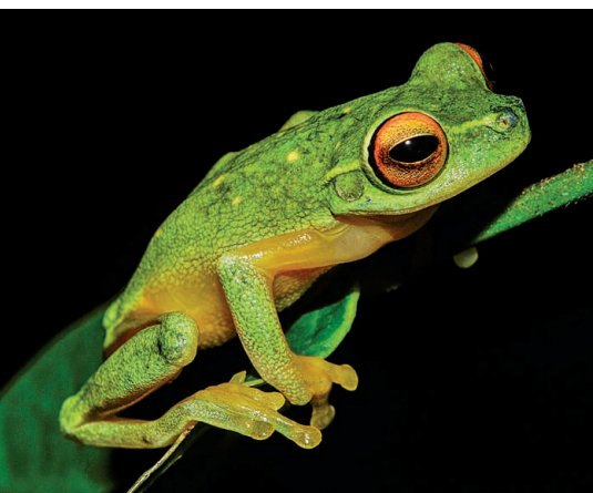
The frog species Litoria auae is endemic to Papua New Guinea, where no parasitic chytrid fungi have been detected to date.

each of which have native salamanders. Immediate research into modes of transmission, susceptible species and habitats, and available treatment options enabled accurate risk assessments to inform policy (12). Importation of salamanders through the pet trade posed the greatest risk of pathogen introduction, and this threat led to lobbying for an importation ban by academics, government officials, and nongovernment organizations, supported by the private sector. Resulting legislation banned the import of 20 salamander genera; a voluntary moratorium by the Pet Industry Joint Advisory Council included additional genera. This example illustrates the power of multiple stakeholders to imple-